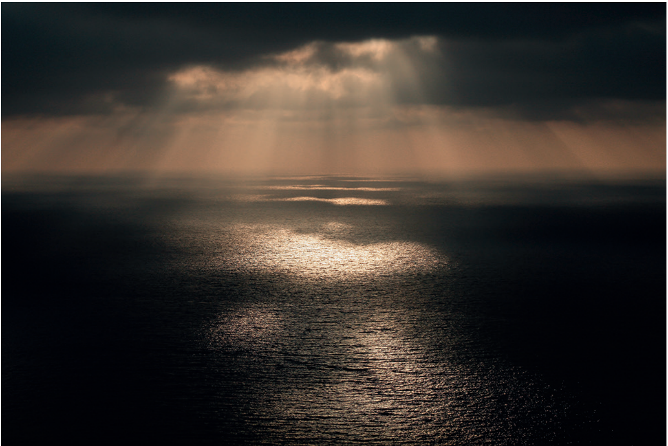
Experimental Ocean, 2018