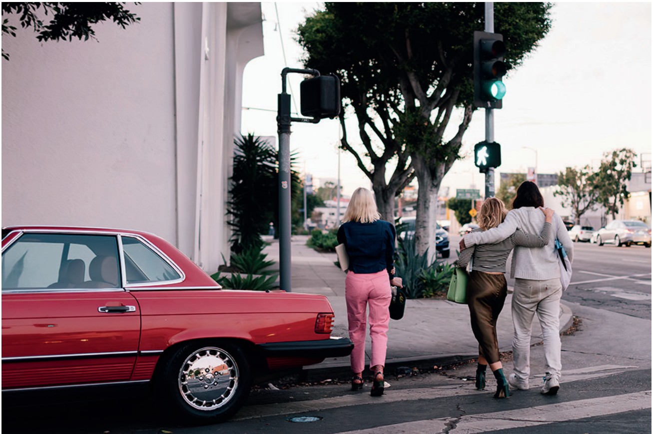
After the books fair, November 2019