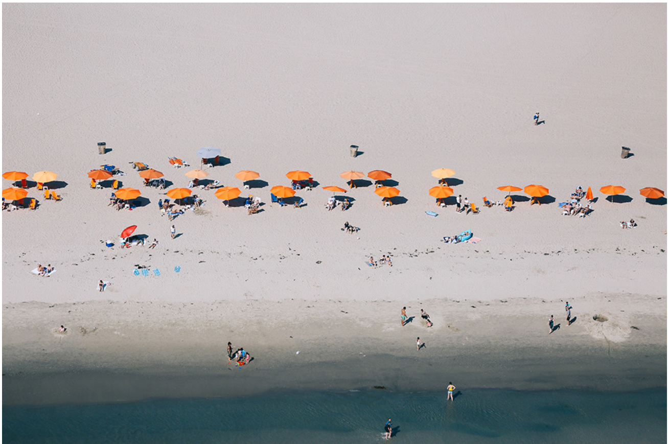
Umbrellas paradise, 2017

contact@karlhab.com info@hvw8.com @karlhab @hvw8gallery