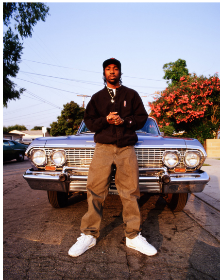
MC Eiht Compton, CA 1994 Digital Color print on Hahnemühle Photo Rag 20x24 inches