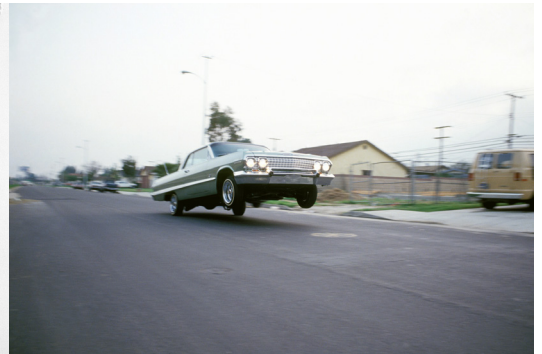
Young Nas (left image) Queensbridge Houses, NYC 1993 Digital Silver Gelatin Print 20x24 inches