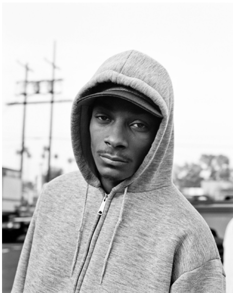
Snoop Doggy Dogg Los Angeles, CA, 1993 Digital Silver Gelatin Print 20x24 inches