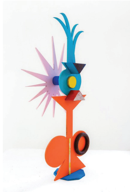
Sternleuchter, 2018