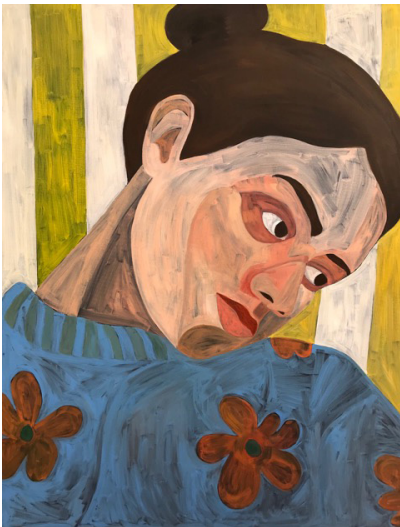
Inès Longevial – “Waiting for the sun” Oil on linen, 2018 154 x 114 cm

Four Conversations continues this ongoing dialogue with a diverse international group of emerging artists.