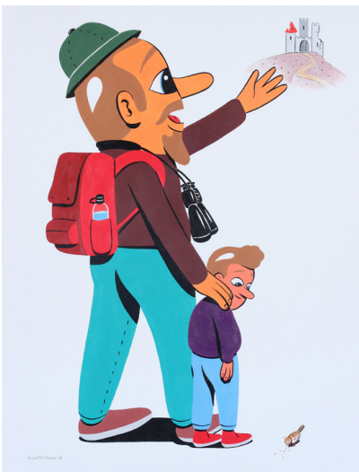
HuskMitNavn – “Look soon” Acrylic on paper, 2018 30 x 40 cm