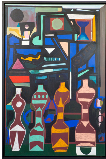
44Flavours – “Kettbaum, St.Moritz/Berlin” Acrylic on canvas, 2015 150 x 100 cm