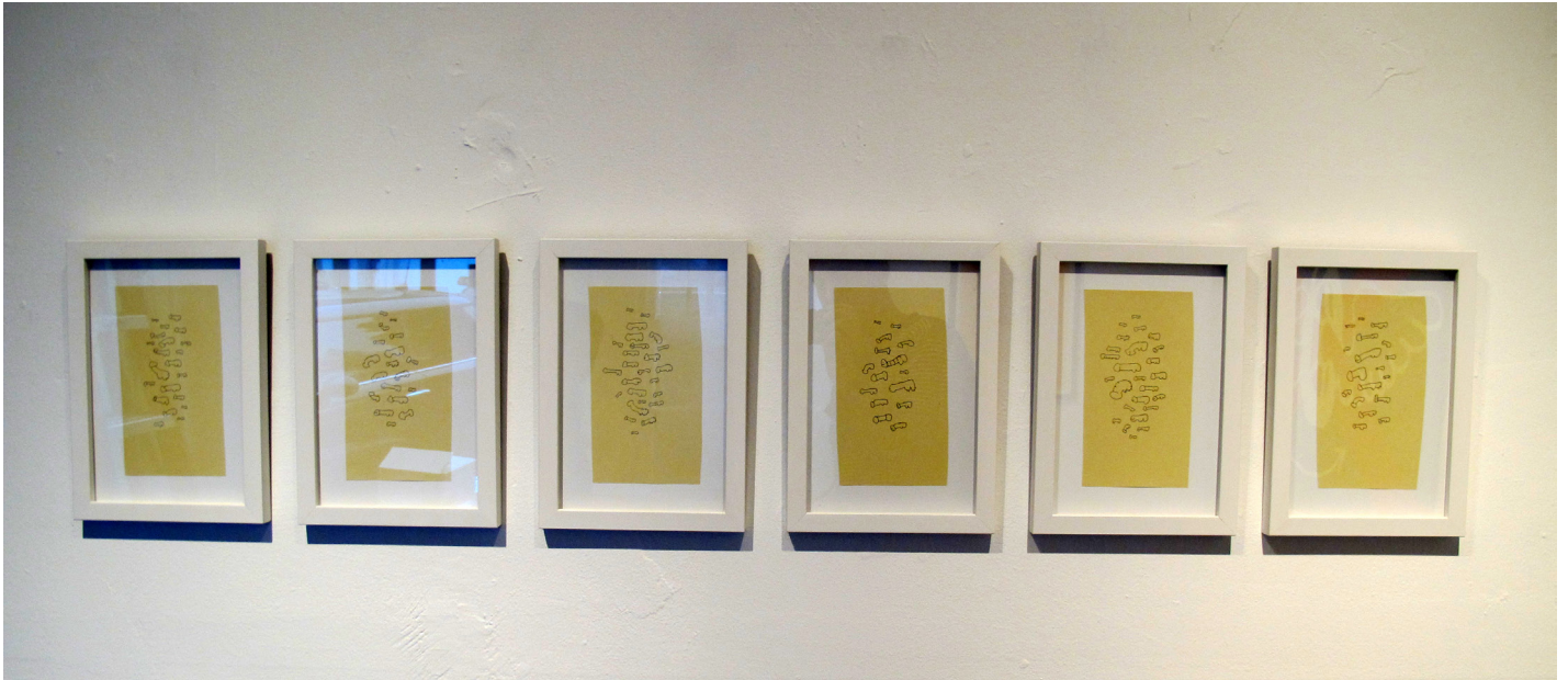
Cody Hudson Untitled Drawings (Dicks on Parade Series) Ink on paper 5" x 9" 500